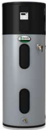
Hybrid Electric Heat Pump Tank Water Heaters: HPTU-50N

water heaters. Some models have a hybrid mode where they switch if the room temperature, from which the heat for the water comes from, is too cool.